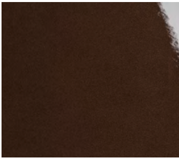
Tobacco High Gloss